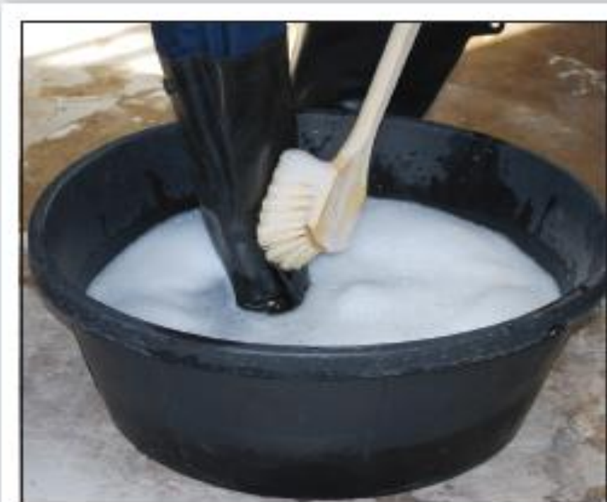
Wash boots in between visiting different premises.